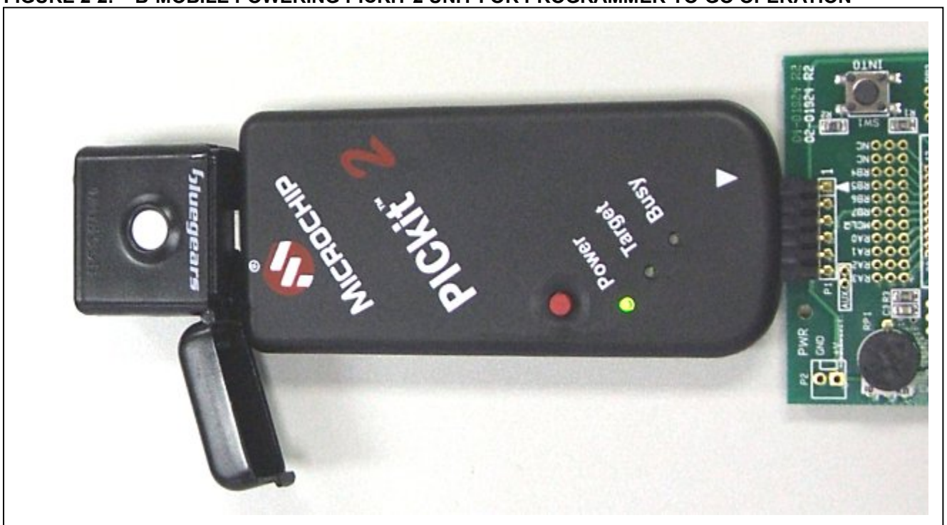
FIGURE 2-2: B-MOBILE POWERING PICKIT 2 UNIT FOR PROGRAMMER-TO-GO OPERATION