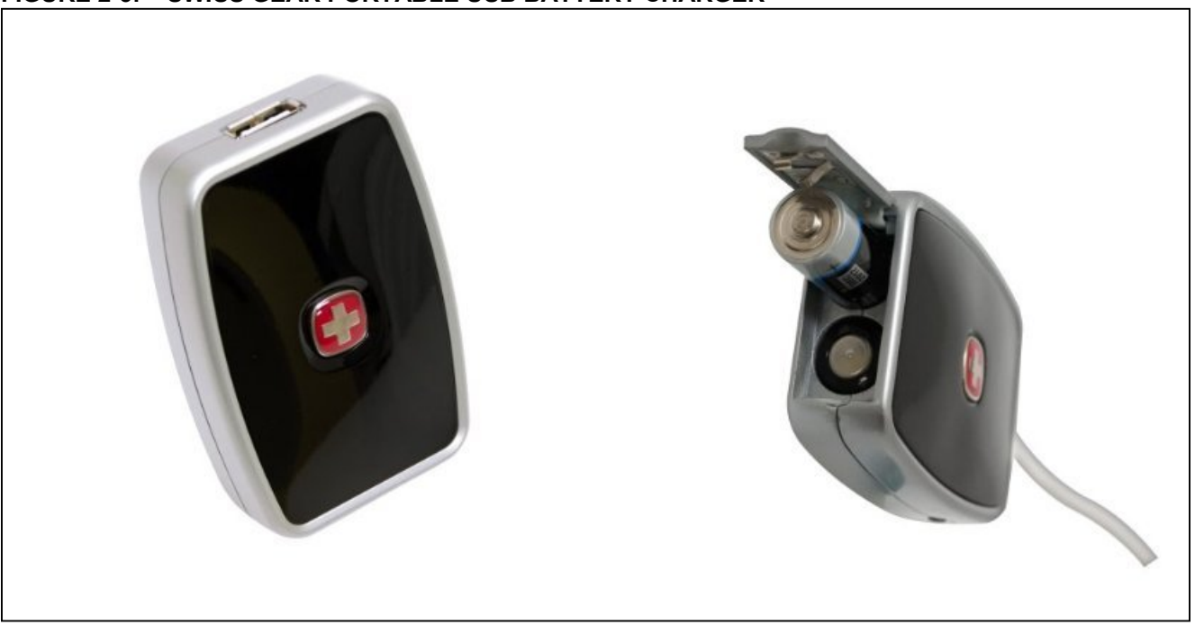
FIGURE 2-3: SWISS GEAR PORTABLE USB BATTERY CHARGER

This device runs off of 2 standard AA batteries. It has a USB 'A' connector that any USB cable can be plugged into to provide power to a USB device. Simply plug in the included PICkit 2 USB cable between this device and the PICkit 2 for portable power.