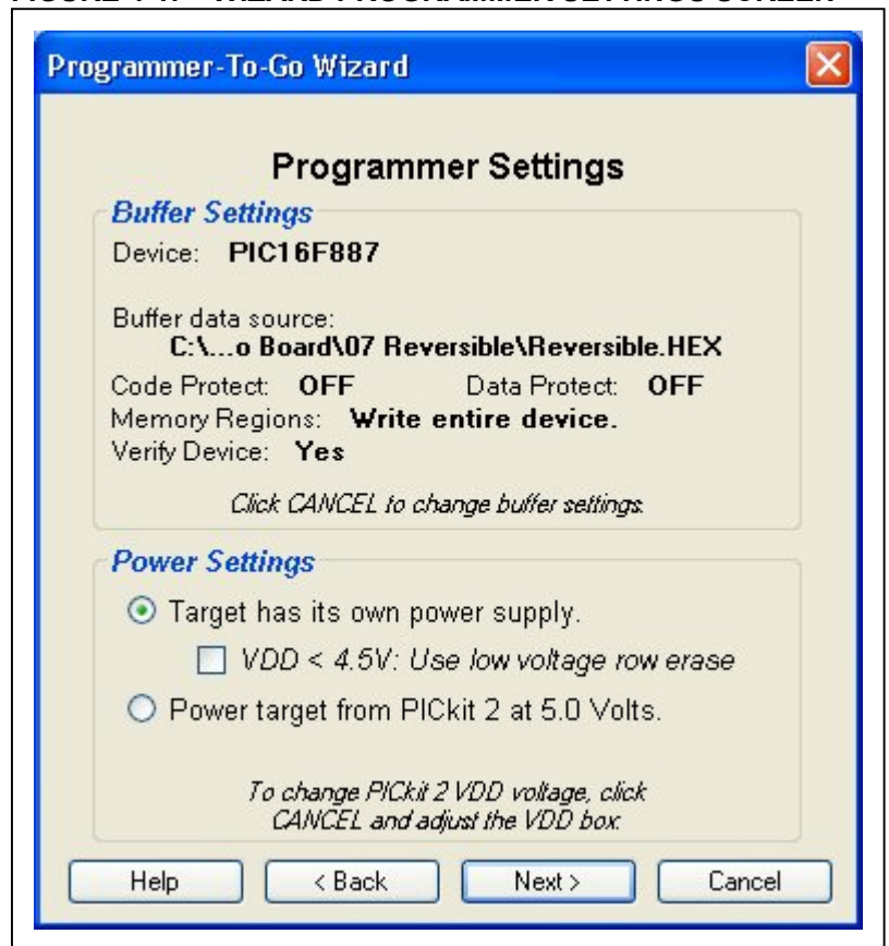
FIGURE 4-1: WIZARD PROGRAMMER SETTINGS SCREEN

Programmer > Verify on Write is checked.