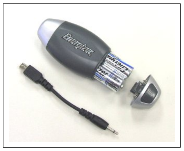
FIGURE 2-4: ENERGIZER ENERGI TO GO

This portable cell charger device runs off two standard AA batteries, and connects via a short cable to the PICkit 2 unit. Several versions of this product are available. The one that may be used with PICkit 2 is part number CEL2MUSB for "mini USB" cell phones. Please note: 2 versions of the CEL2MUSB product are available. These look for current draw from the connected USB device before turning "on", and one version has a high detection threshold that is not turned on by the small current draw of PICkit 2. The version that works with PICkit 2 has textured lines on the battery cover button. The version that does not work has a smooth button. See Figure 2-5 for reference.