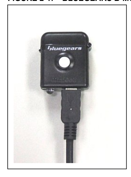
FIGURE 2-1: BLUEGEARS B-MOBILE